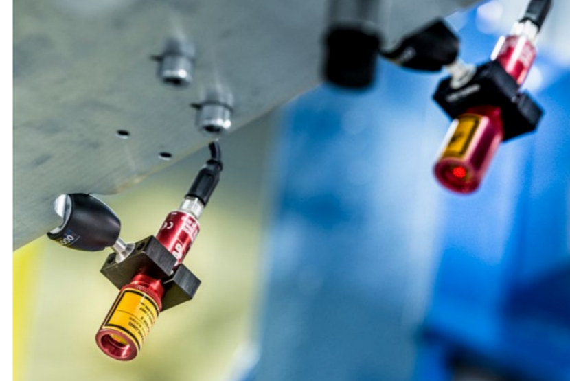
LAP LD point lasers are installed in a tight space in the upper tool of the pressing laminating system.

The primary function of the KEK 80/280 pressing laminating system is positioning decorative materials on interior door panels and bonding them to the interior components. During production, automotive manufacturers carry out all individual procedures, including lamination, in precisely timed and automated processes. However, before pressing, the decor must be manually placed on the seam sword. This is challenging because the operator performs this action with the outside of the material facing down. However, precise positioning is important for meeting demanding design and build-quality requirements using these high-end decor materials. "The difficulty lies in positioning the decorative seam precisely on the seam sword. Since the decor covers the seam sword, the operator cannot see where exactly the decor should be placed," explains Michael Lorenz, AES/Director of E-Design at KIEFEL GmbH.