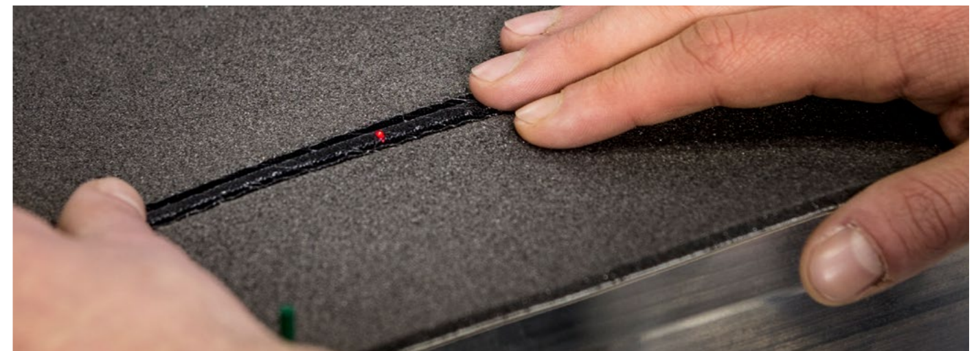
The spot lasers mark the course of the decorative seam at multiple points on the back of the decor. This enables fast, precise positioning.