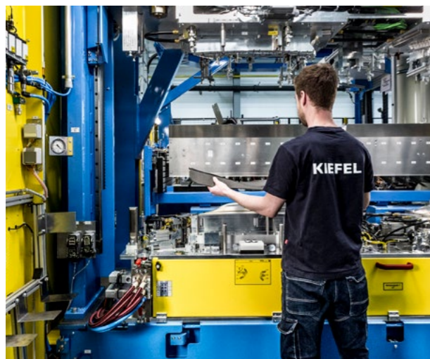
Before pressing, the decor is manually placed on the lower tool.

Avoidance of errors through visual positioning assistance