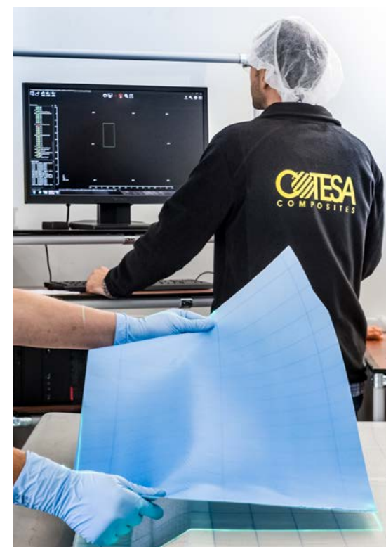
LAP's PRO-SOFT software controls all work steps, from the projection to the generation of order-related log files.