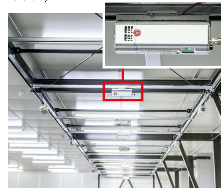
LAP CAD-PRO laser projectors are installed under the ceiling above the workstations. The system's configuration is highly flexible, enabling it to handle tools of different sizes, which are positioned in the projection area on mobile tables.