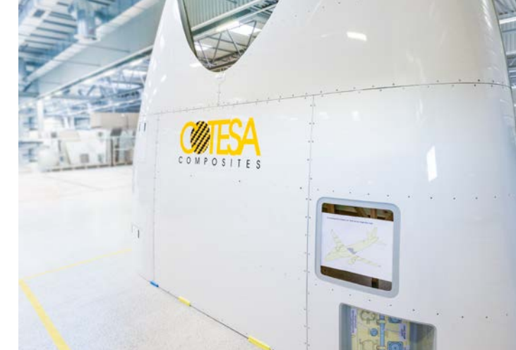
At its approximately 40,000-square-foot factory in Mochau, Germany, COTESA manufactures fuselage components made of high-quality fiber composite components for the A320 family.

In total, seven workstations are set up for laser projection. COTESA decided in favor of the diode-based LAP CAD-PRO laser projectors with green laser sources. These lasers feature a service life of more than 30,000 hours, are focusable and provide clearly visible laser lines. All of these benefits help ensure highly reliable processes. The laser projection system also features the flexibility needed to handle different component sizes, ranging from 10 to 20 square feet. To process larger tools, some stations are equipped with up to four projectors. With the laser projection system in place at each station, COTESA is well prepared to produce even faster and more efficiently in the future.