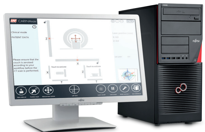
Option 3: Desktop PC