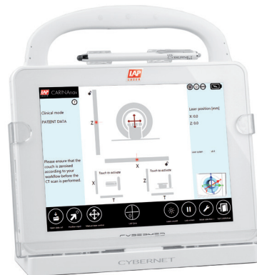
Option 1: Cybermed tablet PC