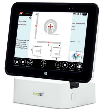
Option 2: Baaske Docpad tablet PC